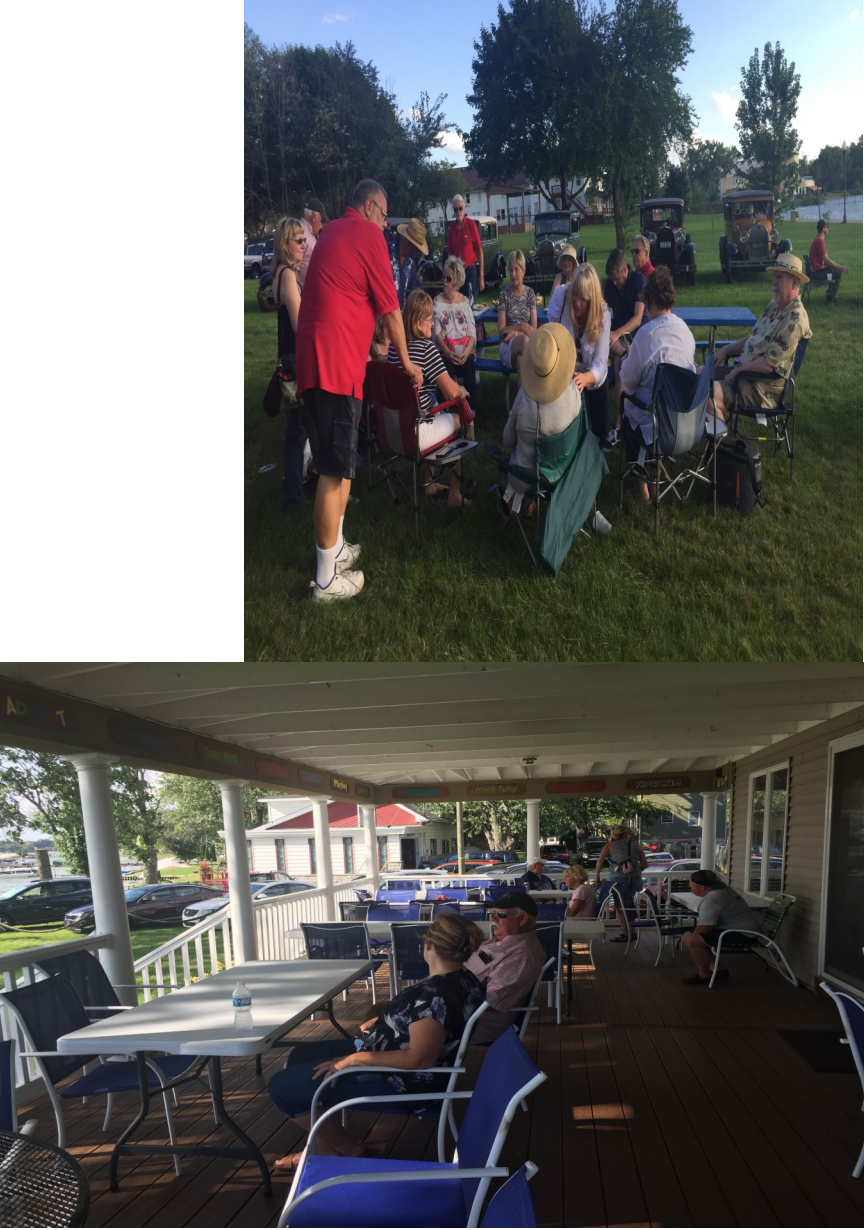
Overall it was a gorgeous day out at the lake.