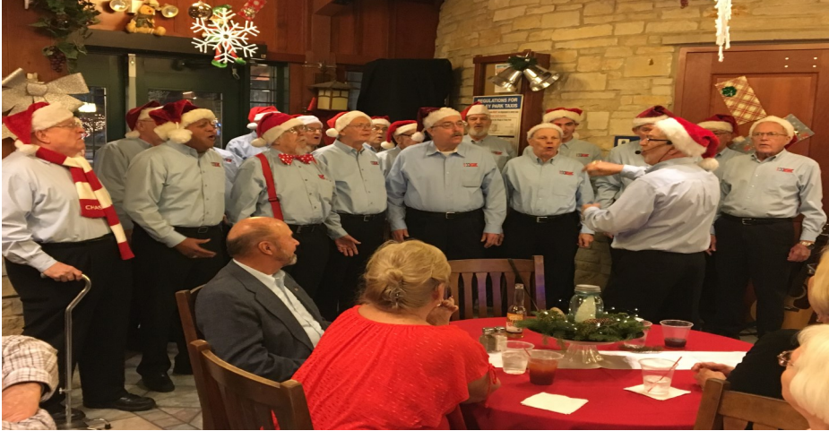
The nights entertainment: the "Knights of Harmony".