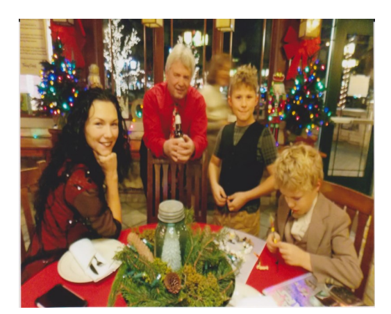
It's nice to see family and friends together at the holidays. (The A's are a family).