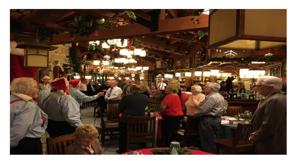
Now that's a good looking group of people singing .

It's the start of another new year and I hope all of your celebrations were joyful and safe. I know I had a real fun time at our last Christmas party.