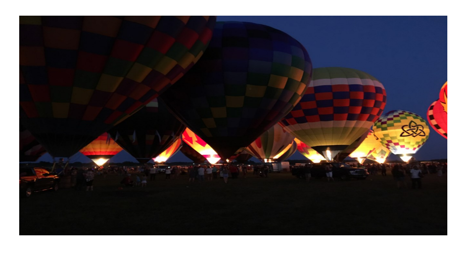
Great finish to a great day.