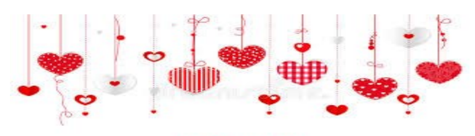
HAPPY VALENTINE'S DAY