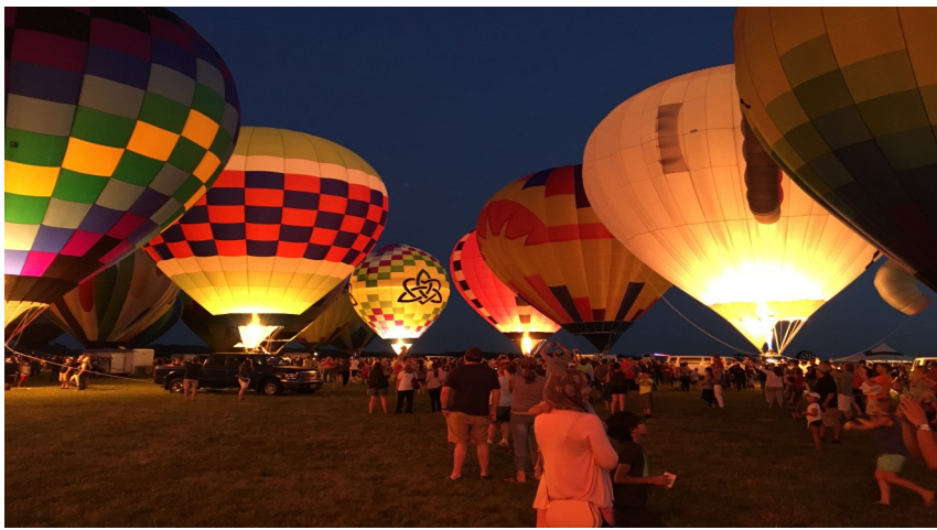
These balloons were an awesome sight lit up at night.