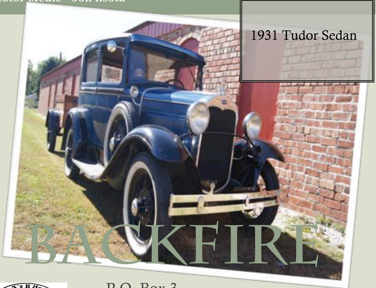
1931 Tudor Sedan